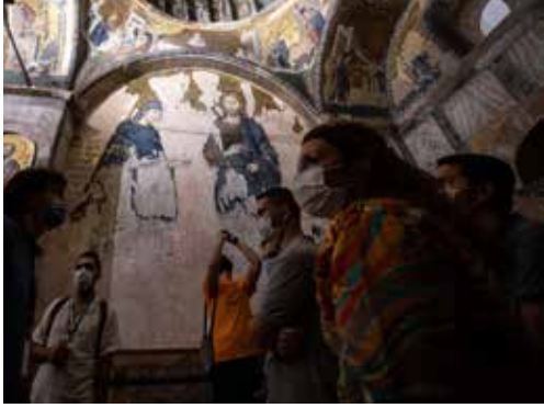
CHRISTIAN HERITAGE. Tourists listen to their guide during their visit to the Chora (Kariye) Church Museum, the 11th-century Church of St. Savior on Aug. 21 in Istanbul. The Chora Church Museum, as well as the more famous Hagia Sophia, were converted to a mosque and opened to Muslim worship, as ordered by a Turkish presidential decree. The interior of St. Savior is decorated with some of the oldest surviving Byzantine mosaics and frescoes.

But a miracle in Brazil — a boy healed from a life-threatening defective pancreas — showed how close and universal the saints are. The saint who interceded for him? Blessed Carlo Acutis.