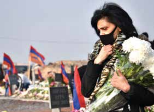
GENOCIDE RENEWED. People visit the graves of their relatives killed during the Azerbaijan-Armenia conflict in Yerevan, in the region of Nagorno-Karabakh, Dec. 12. Azerbaijani aggression toward Armenia renewed memories of the Turkish campaign of genocide in the early 20th century.