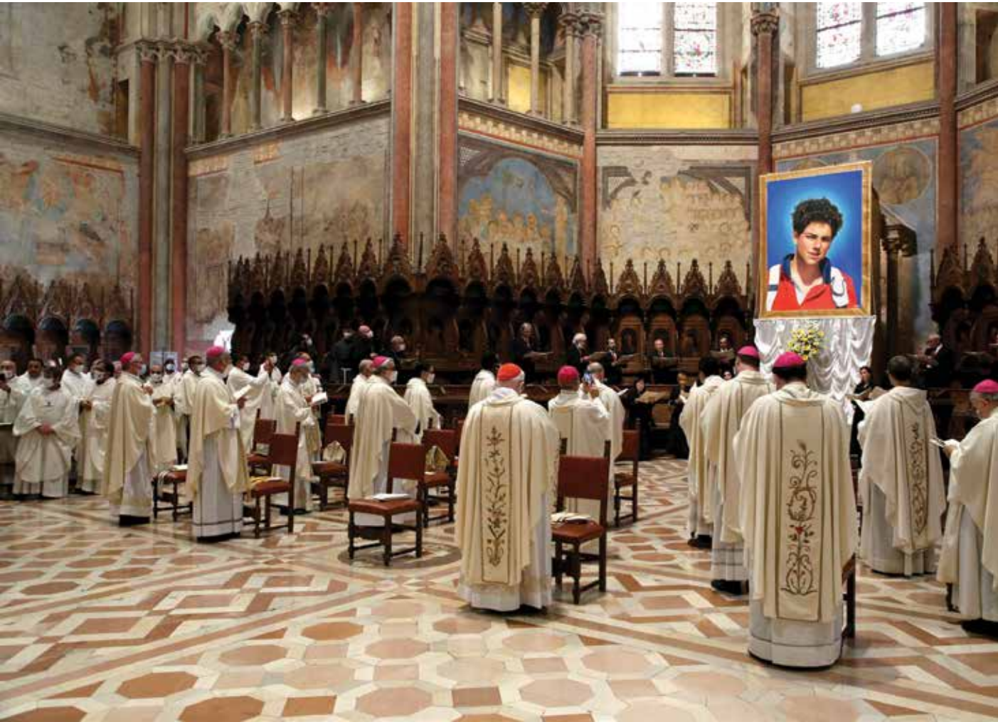
BLESSED CARLO. Cardinals, bishops, friars and priests attend the beatification ceremony of Blessed Carlo Acutis Oct. 10 at St. Francis Basilica in Assisi, Italy. Blessed Carlo, who died in 2006 from leukemia, created a website dedicated to cataloguing each reported Eucharistic miracle in the world.