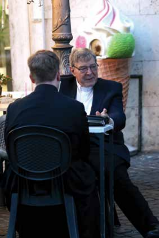
FREED. Cardinal George Pell of Australia talks with a young priest near St. Peter’s Square Oct. 4 in Vatican City. Melbourne’s High Court freed the Australia cardinal April 7 following more than 400 days of incarceration after unanimously finding he was wrongly convicted of sexual abuse of a minor.