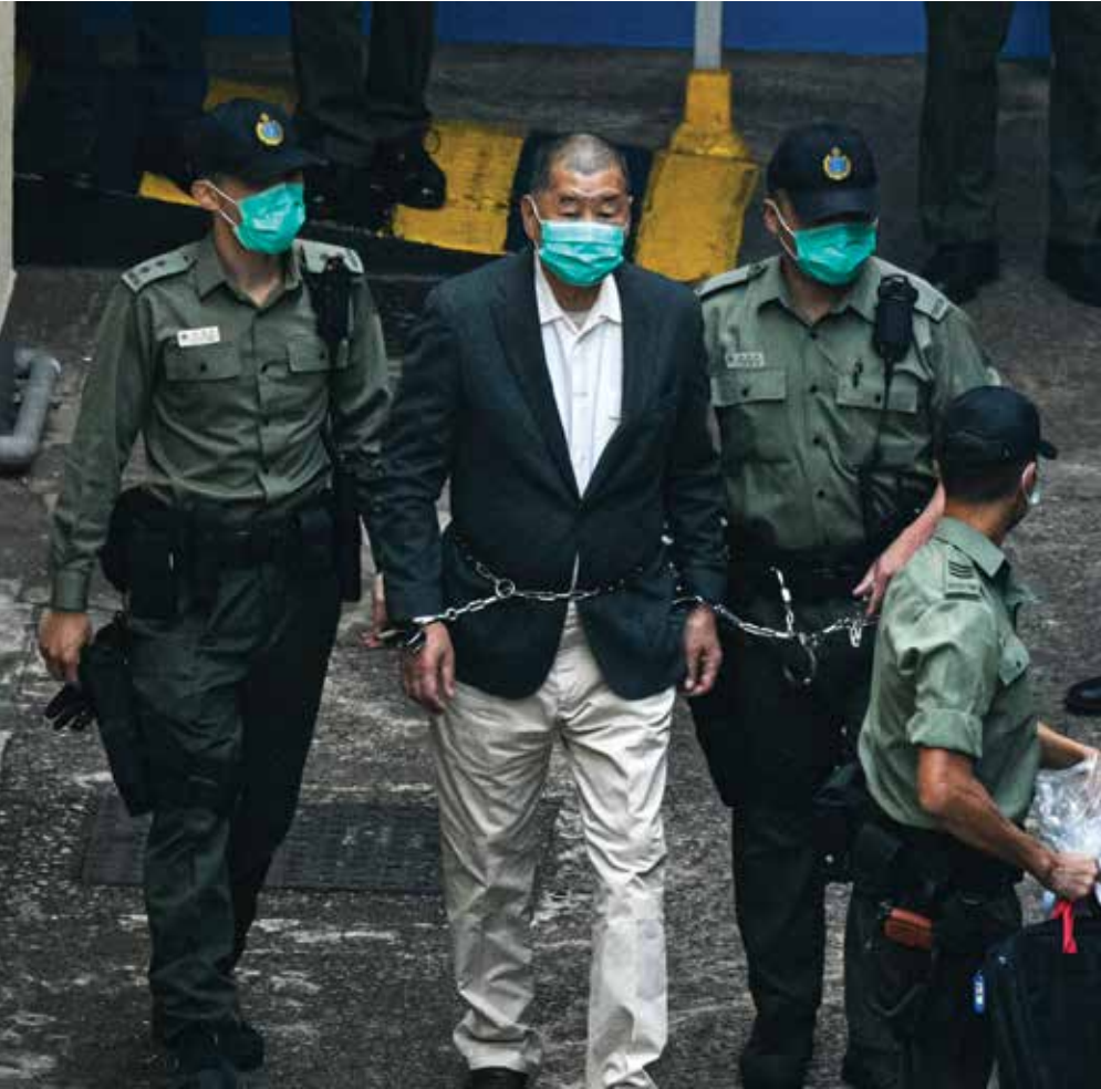
CATHOLIC CRACKDOWN. Hong Kong Catholic media tycoon Jimmy Lai is handcuffed and escorted by guards leaving Lai Chi Kok Reception Center on Dec. 12 in Hong Kong for alleged crimes against the state. The Communist Chinese government stepped up efforts to curb free speech and freedom of religion in 2020.