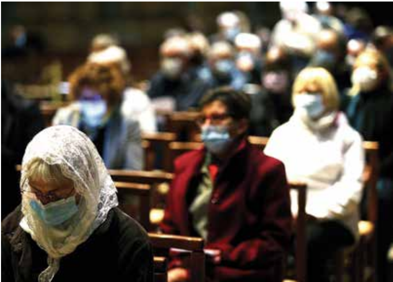
RESPONSE TO TERRORISM. People attend a Mass for France Oct. 30 at Notre-Dame de Reims Cathedral in Reims in remembrance of the three victims of a knife attack at Nice Cathedral the previous day. A 21-year-old Tunisian Muslim cut the throats of two of his victims. The government described the killings as an act of Islamist terror.