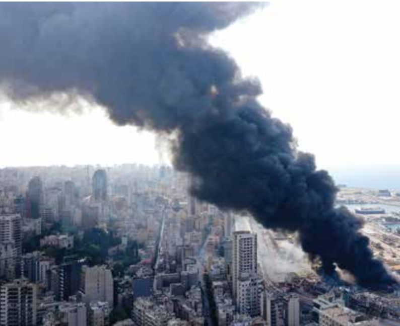
DEADLY FIRE. Smoke billows from the Beirut Ports Free Zone following a massive Aug. 4 chemical blast that killed 190 people and crippled the already economically depressed country.